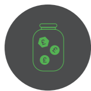
Pension Scheme Auto Enrollment