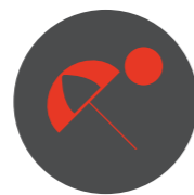
Great Annual Leave Allowance