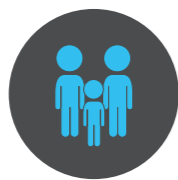
Family Friendly Policies