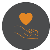
Health Care Plan