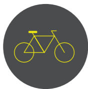
Cycle to Work Scheme