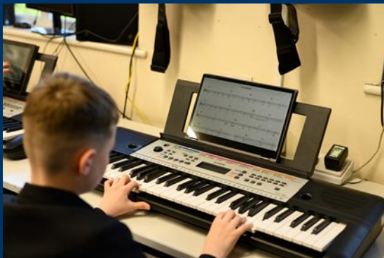
Year 7 student using a Chromebook in music lesson

This has significant benefits for students in school as well as for homework or any future remote learning. The device on offer is the Lenovo 300E, a tried and tested device, powerful and compact but robust enough for school use.