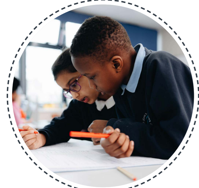
ST JOHN'S & ST PETER'S