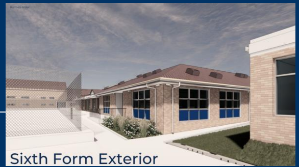
Sixth Form Exterior

The Cottesloe School is delighted to announce the recent approval of planning permission to improve its facilities. The school continues to grow in popularity and has agreed to meet the need for more school places in North Bucks. This expansion will see Year 7 to 11 expanding to 210 students, an increase of 20 students per year group, over the coming years. This significant development marks a milestone in the ongoing commitment to provide quality education infrastructure for the growing local community.