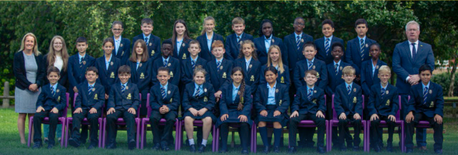
Nicholas Breakspeare Catholic School - 7 Lisieux, 2021

Nicholas Breakspeare Catholic School is a positive and vibrant community that is constantly evolving. Our pupils are fully engaged with their studies and interests which enables them to fulfil their true potential. We are proud to be a school that is