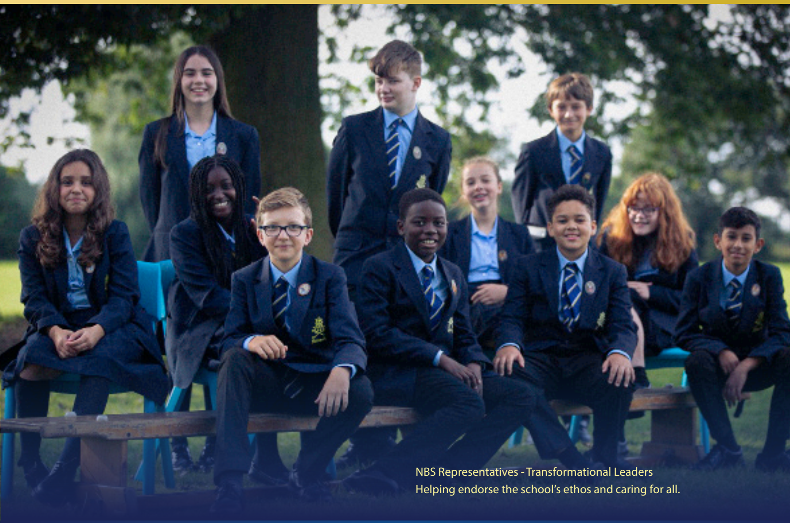
NBS Representatives - Transformational Leaders Helping endorse the school's ethos and caring for all.

The NBS Pupil Profile guides our students to grow into confident citizens to fulfill the school's Mission – to build a better world.