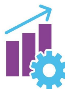
Performance Management Process