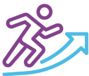
Professional Development Opportunities

We offer regular training and access to a range of internal and external programmes tailored to your learning throughout your career, including NPQs and other professionally accredited qualifications. There are opportunities for career progression with your home school or in other schools across the Trust as well as opportunities to move from our support team to a teaching role.