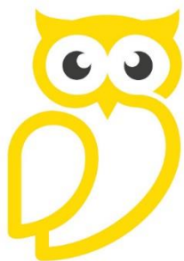
Field Lane Primary

Schools within the Polaris Multi-Academy Trust