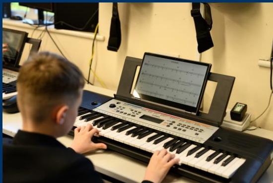
Year 7 student using a Chromebook in music lesson

This has significant benefits for students in school as well as for homework or any future remote learning. The device on offer is the Lenovo 300E, a tried and tested device, powerful and compact but robust enough for school use.