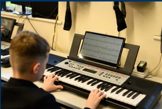
Year 7 student using a Chromebook in music lesson

This has significant benefits for students in school as well as for homework or any future remote learning. The device on offer is the Lenovo 300E, a tried and tested device, powerful and compact but robust enough for school use.