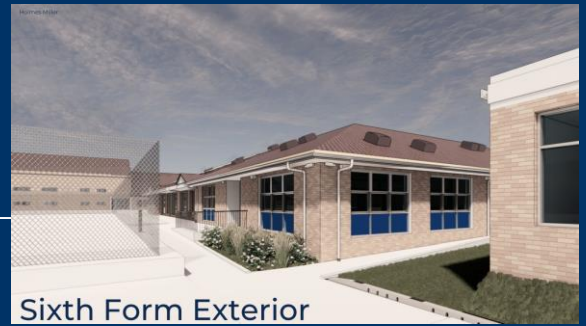
Sixth Form Exterior

The Cottesloe School is delighted to announce the recent approval of planning permission to improve its facilities. The school continues to grow in popularity and has agreed to meet the need for more school places in North Bucks. This expansion will see Year 7 to 11 expanding to 210 students, an increase of 20 students per year group, over the coming years. This significant development marks a milestone in the ongoing commitment to provide quality education infrastructure for the growing local community.