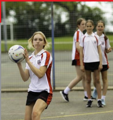
Annual Celebration of Sport Award